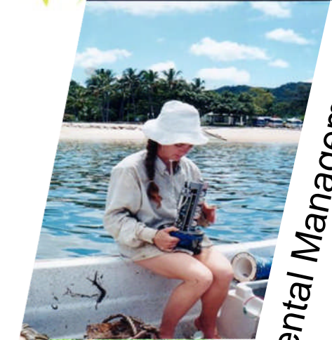
Tropical Environmental Management